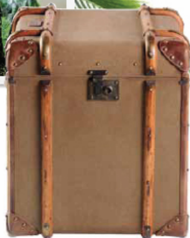
Globetrekker Lamp Table By Timothy Oulton