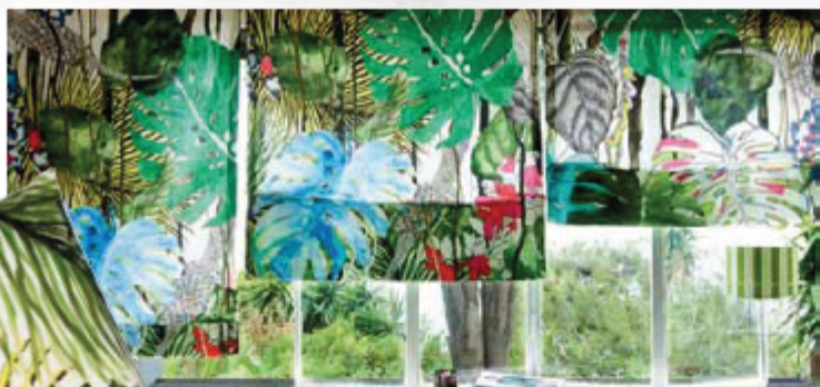
Belles Rives Collection By Christian Lacroix Maison